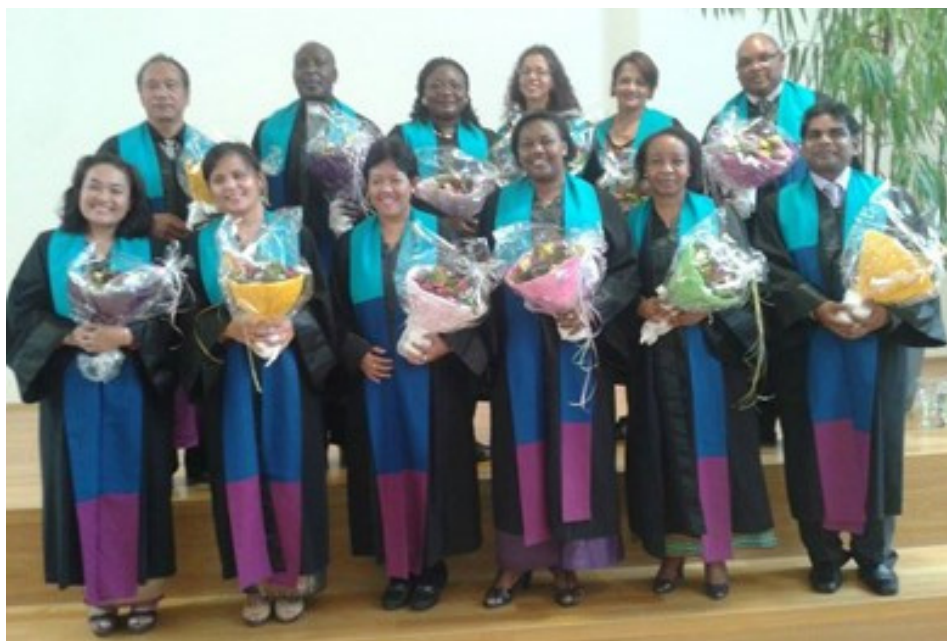
IMADM K2 (2013-2015)

vision which led to the establishment of cooperation between the Institute for Diaconic Science and Diaconic Management-IDM, Wuppertal/Bethel. The first cohort – K1 of twelve (12) students were admitted in 2011 and successfully completed in 2013. In September 2020, the fourth cohort – K4 graduated and for the first time with final exams conducted digitally due to the Covid-19 Pandemic. The IMADM can boast of producing top executives for churches, theological institutions, universities, diaconic institutions and PhD candidates